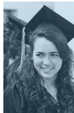
Average cost of attending UAS in Juneau for one year. Includes tuition, student fees, books, and supplies in 2016.