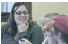
Average Juneau Child Care Wage