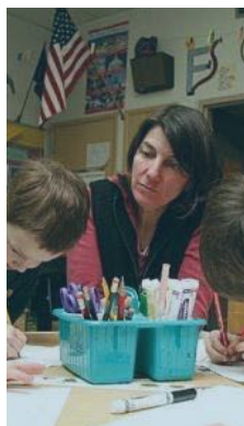
Average Juneau Kindergarten Teacher salary