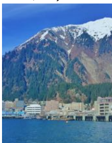
Average Juneau Wage