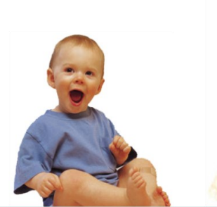
I was referred for early intervention services and now

For every dollar spent on early care and learning in Alaska, there is a $1.50 in total economic activity.