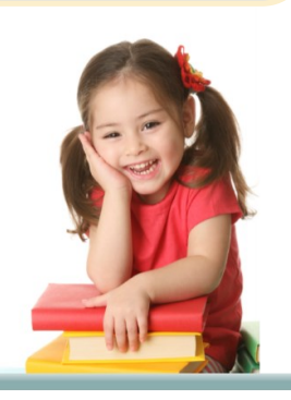
I have great teachers at my child care and Head Start. lot about helping kids learn.